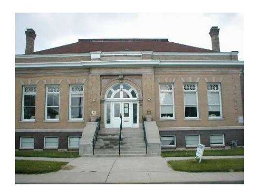
Hawthorne Community Center, Near Westside