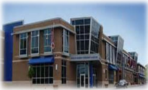
John Boner Neighborhood Centers, Near Eastside